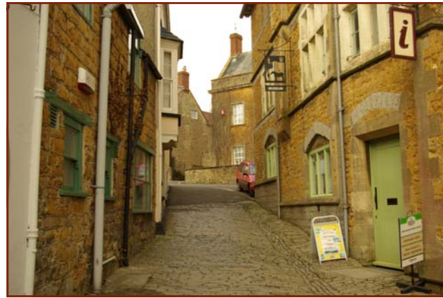
Views at Bailey Hill